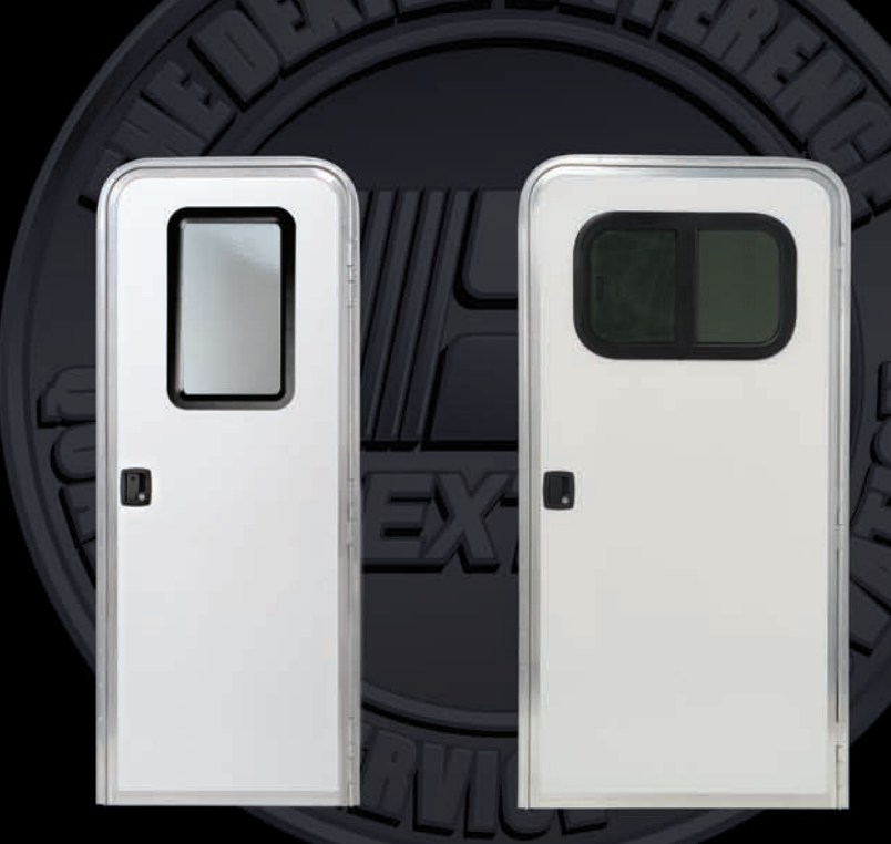
3.) Radius Corner 12" x 21" Window