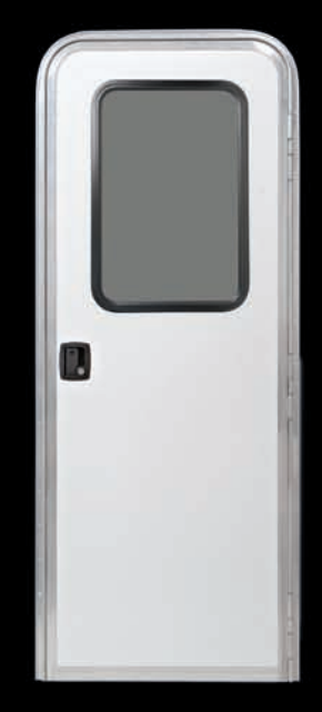
2.) Radius Corner 20" x 30" Window